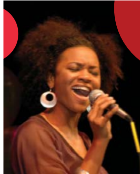
Syesha Mercado, American Idol season 7 Booker High School class of 2005

Career and Technical Education prepares students for higher education and the workforce. CTE programs are in place in all high schools and middle schools. High school students have the opportunity to earn industry certifications and licensures and the Florida Ready to Work credential. The Sarasota County Technical Institute and Suncoast Polytechnical High School are devoted entirely to CTE programs.